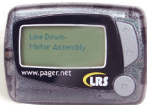
Battery-Operated Alphanumeric Pager