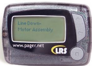
Battery-Operated Alphanumeric Pager