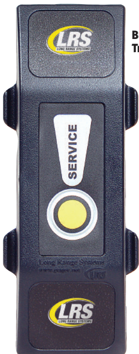
Butler XP Transmitter