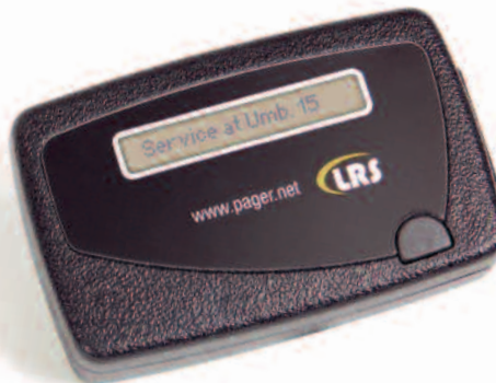
1-Line Rechargeable Alphanumeric

Beach Butler works with both LRS Alphanumeric pagers.