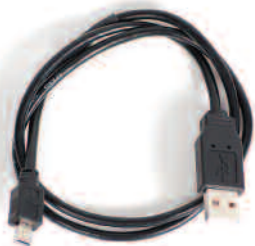
Programming CD (not shown) and cable.