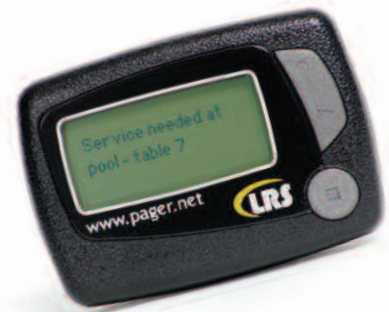
4-Line Battery-Operated Alphanumeric